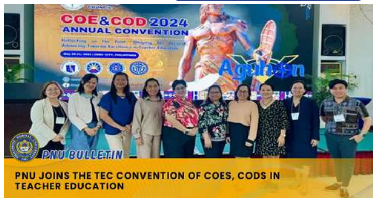
PNU JOINS THE TEC CONVENTION OF COES, CODS IN TEACHER EDUCATION

Concurring with the DepEd Secretary’s message, Usec. Gonong emphasized that it is important for TEIs to graduate well-prepared teachers – one way is to train pre-service teachers on the new MATATAG curriculum.