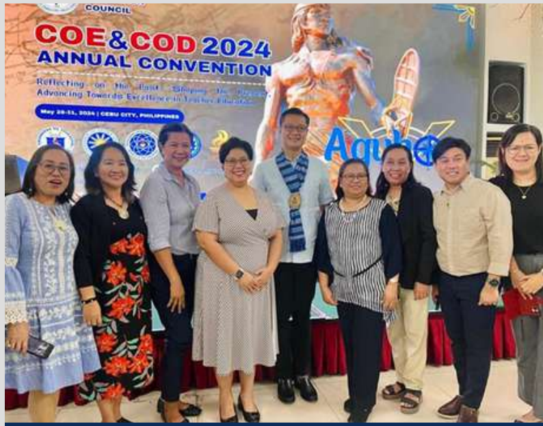
(PNU delegates with Senator Sherwin Gatchalian)

Senator Sherwin Gatchalian was a guest of honor on the third day and emphasized the potential of RA 11713 in reshaping the landscape of teacher education, contingent upon successful implementation.