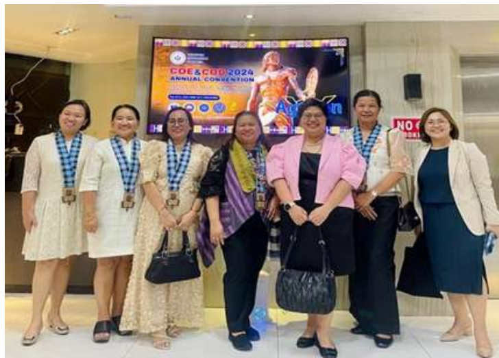
(PNU delegates attended the Gala Night on May 29 at the Cebu City Hall.)