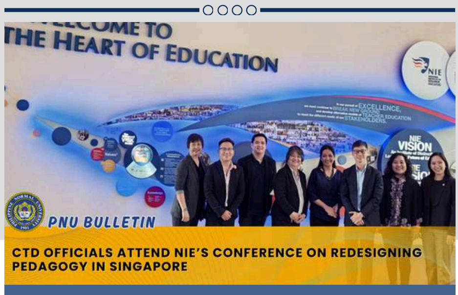
CTD OFFICIALS ATTEND NIE'S CONFERENCE ON REDESIGNING PEDAGOGY IN SINGAPORE

The highlight of the Redesigning Pedagogy International Conference's opening program was the keynote speech of Mr. Chan Chun Sing, Singapore's Minister for Education. He emphasized an important emerging pedagogy, the pedagogy of one, which is driven by the shift from mass education to mass personalization.