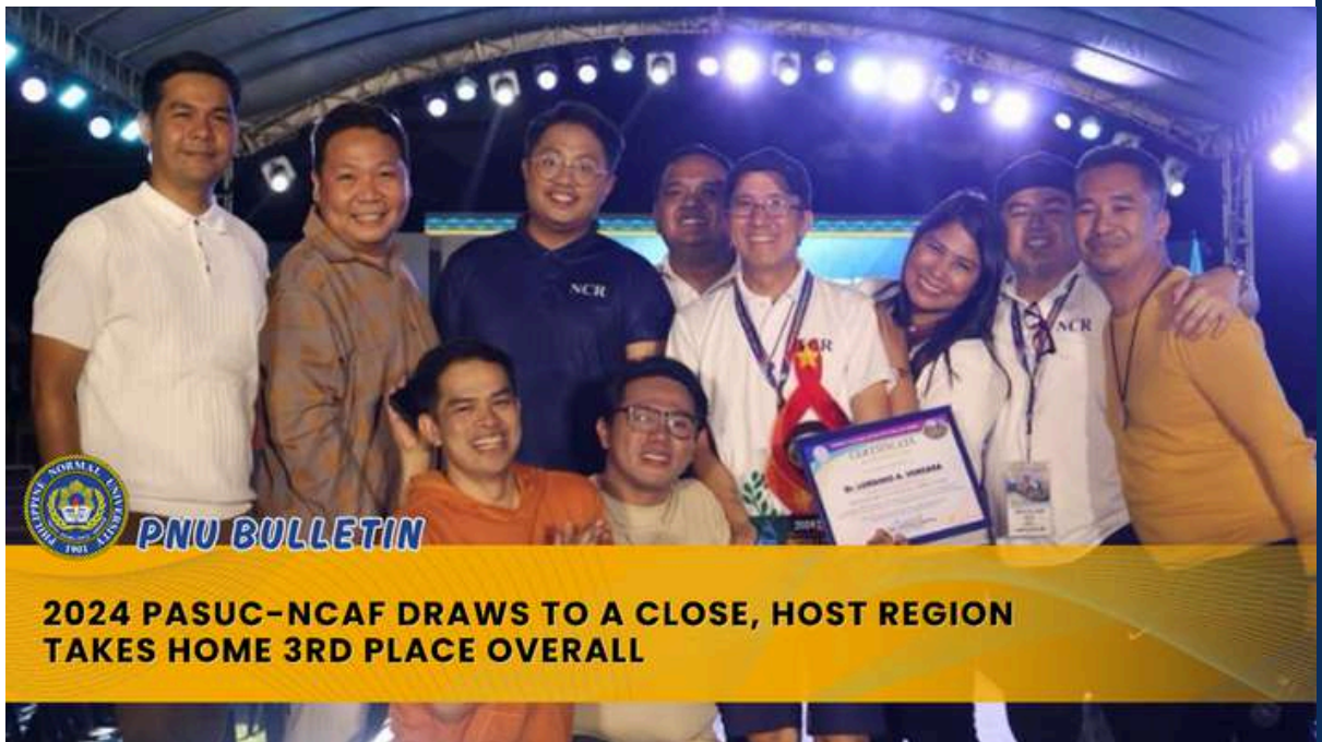
2024 PASUC-NCAF DRAWS TO A CLOSE, HOST REGION TAKES HOME 3RD PLACE OVERALL

During the said concluding program, representatives from Luzon, Visayas, and Mindanao shared their thoughts and experiences during the three-day competition. They have also shared messages of gratitude for the host city and institution.