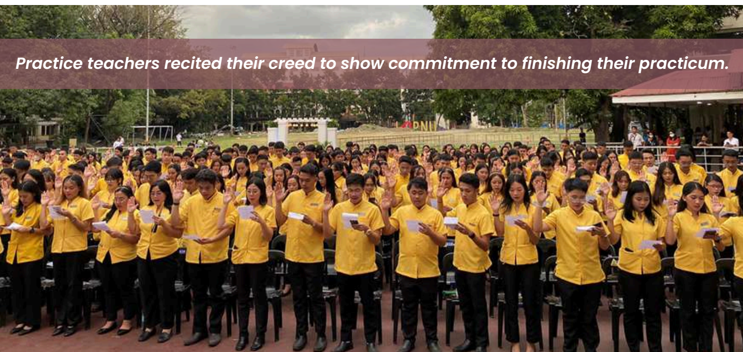
Practice teachers recited their creed to show commitment to finishing their practicum.

With the Pinning Ceremony concluded, pre-service teachers are now prepared to embark on their practice teaching journey, equipped with the knowledge, passion, and values instilled by PNU, poised to make a positive impact in the field of education.