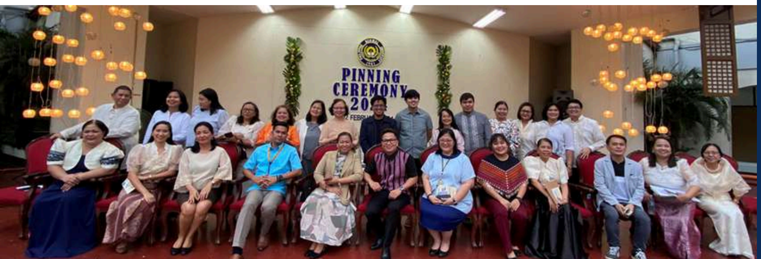
University Officials and faculty members attended the event.