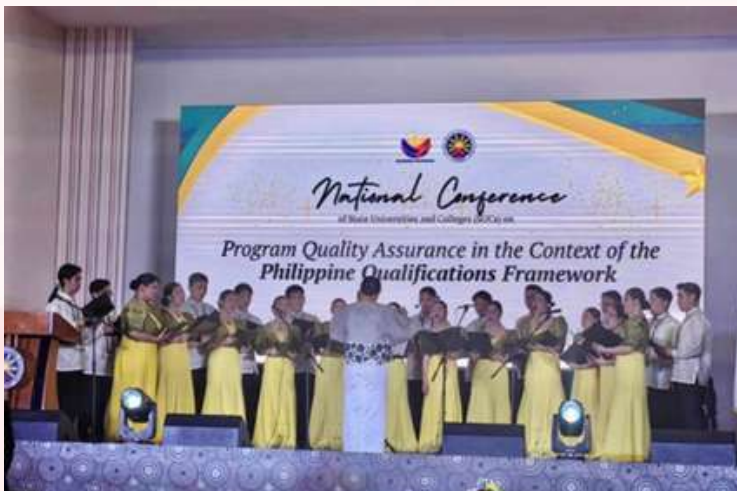
PNU Kalibnusan Chorale performed at the conference.