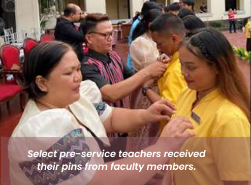
Select pre-service teachers received their pins from faculty members.