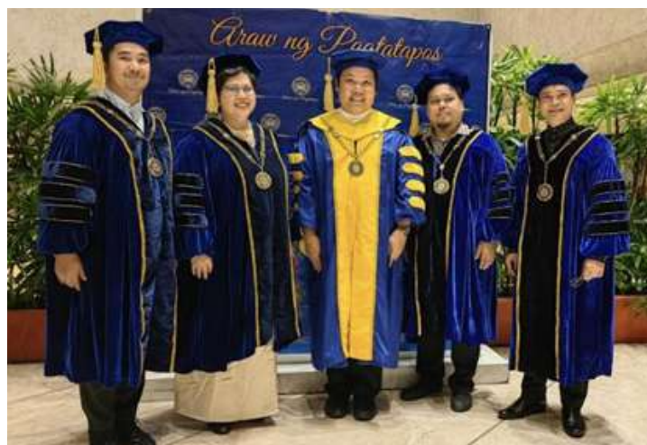
PNU officials donned in their graduation gowns for the Commencement Exercises.

The following day, the much-anticipated graduation rites took place at the PICC Plenary Hall. The Guest of Honor and Commencement Speaker was Congressman Marquez "Mark" Go, Representative of the Lone District of Baguio. Congressman Go is the Chair of the House Committee on Higher and Technical Education (CHTE), Commissioner of the Second Constitutional Commission on Education (EDCOM II) specifically on Higher Education & Teacher Education and Development, and member of the PNU Board of Regents (BOR). His speech echoed themes of growth, resilience, and pursuing excellence. He encouraged the graduates to pursue their aspirations as they strive to become the best version of themselves.