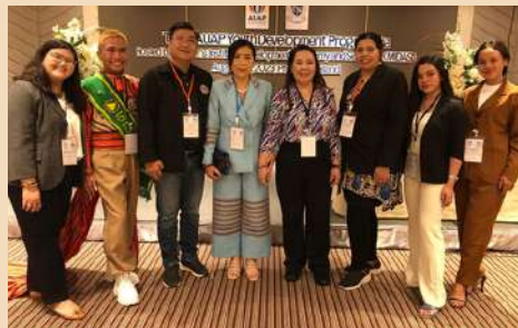
PNU takes part in the 2nd AUAP Youth Development Programme

The Philippine Normal University participated in the Association of Universities of Asia and the Pacific (AUAP) Youth Development Programme (YDP) from August 6 to 11, 2023, in Phuket, Thailand.