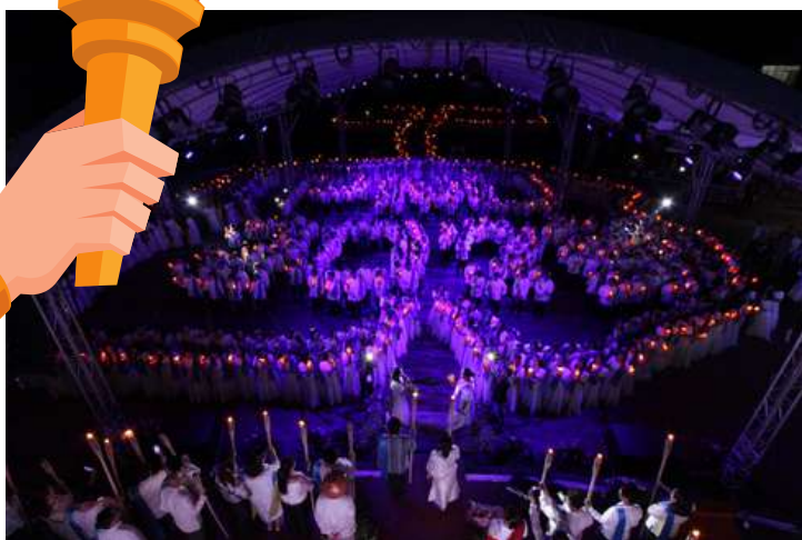
Idinaos ang taunang selebrasyon na Pagdiriwang ng Sulo 2023 para sa mga ikatlo at ikaapat na taon ng Pamantasang Normal ng Pilipinas-Maynila, Miyerkules, Agosto 23.

Bitbit ng mga tauhan ang iba't ibang lagablab bilang tanda ng pagpapatuloy sa ningas at alab ng sulo; Inang Pilipinas bilang Lagablab ng Karunungan, Juan Dela Cruz bilang Lagablab ng Kagitingan, Inang Pamantasan bilang Lagablab ng Kahusayan, Lakan bilang Lagablab ng Kapangyarihan, Lakambini bilang Lagablab ng Katarungan, Inang Kalikasan bilang Lagablab ng Kapaligiran, at Bahaghari bilang Lagablab ng Kalinangan.