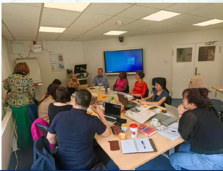
GEDI Participants exchange ideas through a discussion.