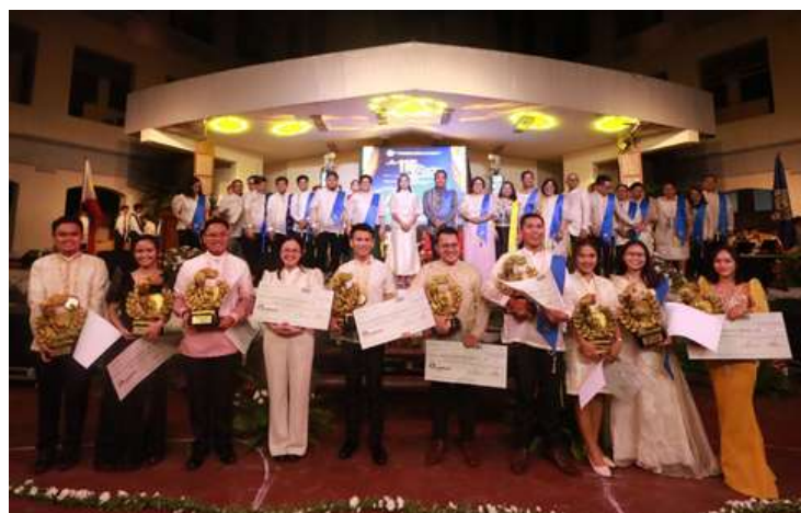
Pinarangalan ang mga PNUans na nagkamit ng mataas na pwesto sa mga nakalipas na licensure examination.