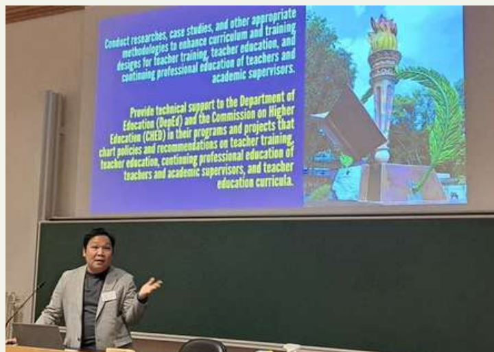
PNU President Tuga participates in GATE 2.0, presents status of teacher education in PH

and guidelines directing teacher education as well as the structures governing teacher education institutions; (3) licensure examination and quality assurance mechanisms; (4) teacher education curriculum with special focus on experiential learning and practicum and the medium of instruction used; (5) contextualization of learning philosophies and theories in teacher education; and (6) issues and challenges perennially confronting teacher education.