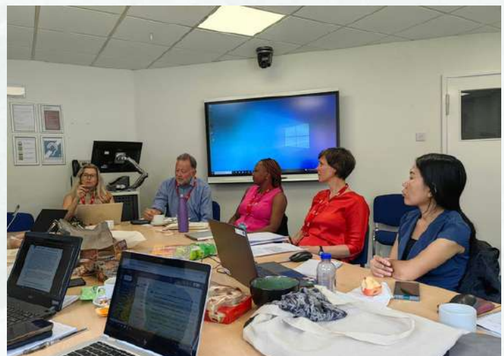
GEDI Participants share their insights and best practices.