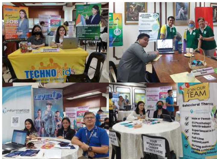
The Academic and Industry Partners prepared for their potential applicants.