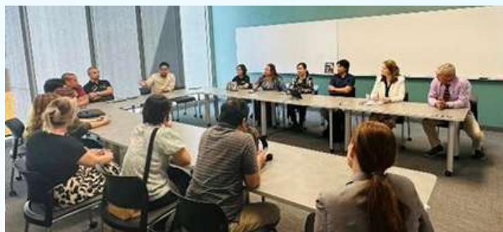
Participants exchange ideas and insights.