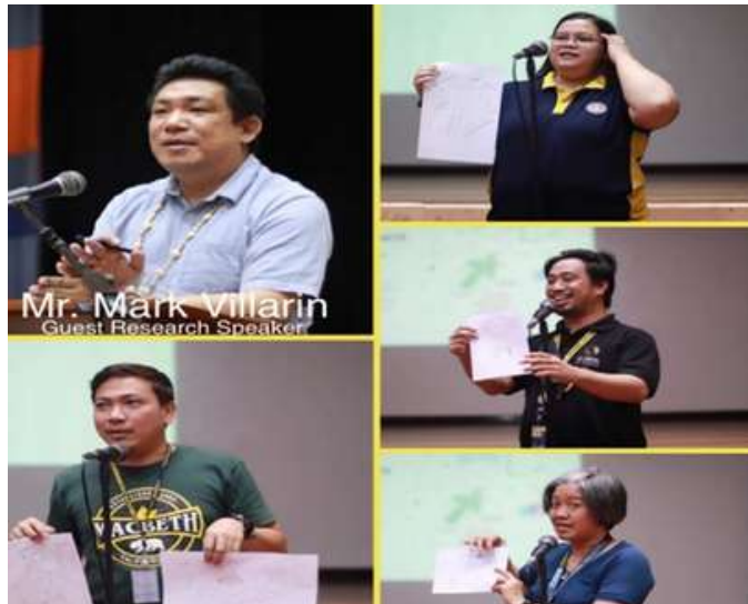
PNU employees showcased their output for the upskilling activity.

Handling and managing events is a rigorous and significant task. It requires planning, time management, and the right skillset in organizing an event face-to-face or virtual. With that, the University Events Management and Public Relations Office organized a seminar entitled "UPSKILLING Training for Supervision and Managing Events" on September 11-13 2023, at PNU Audio Visual Theater, E.P. Dagot Hall Library Building. In line with that, we have invited key speakers from Red Root Artists and Artisans Multi-Purpose Cooperative to shed light and impart wisdom on managing and organizing events.