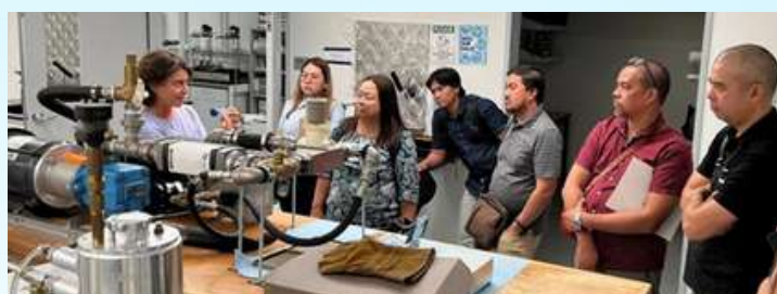
Participants watch a demonstration on fuel cell station operation and testing.