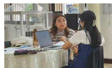
A student-applicant (left) having an interview with a recruitment staff from Enderun Colleges (right).