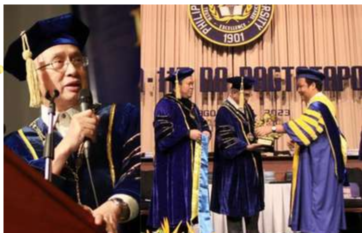
Congressman Mark Go giving his speech of encouragement for the graduates.

The following day, the much-anticipated graduation rites took place at the PICC Plenary Hall. The Guest of Honor and Commencement Speaker was Congressman Marquez "Mark" Go, Representative of the Lone District of Baguio. Congressman Go is the Chair of the House Committee on Higher and Technical Education (CHTE), Commissioner of the Second Constitutional Commission on Education (EDCOM II) specifically on Higher Education & Teacher Education and Development, and member of the PNU Board of Regents (BOR). His speech echoed themes of growth, resilience, and pursuing excellence. He encouraged the graduates to pursue their aspirations as they strive to become the best version of themselves.