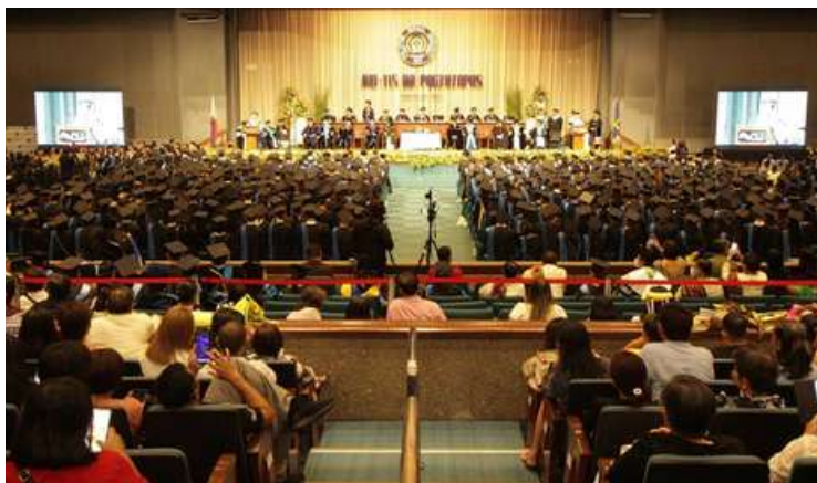
115th Graduation Ceremony at PICC Plenary Hall

Manila, August 29, 2023 – The Philippine Normal University, the National Center for Teacher Education, celebrated its 115th Commencement Exercises, culminating in a grand three-day affair from August 23-25, 2023, marking a triumphant milestone for its graduates who are now ready to make their mark in the world. The series of events leading to the graduation rites showcased the unique journey and victory of the graduates as they bid farewell to their alma mater and prepare for new challenges armed with their earned degrees.