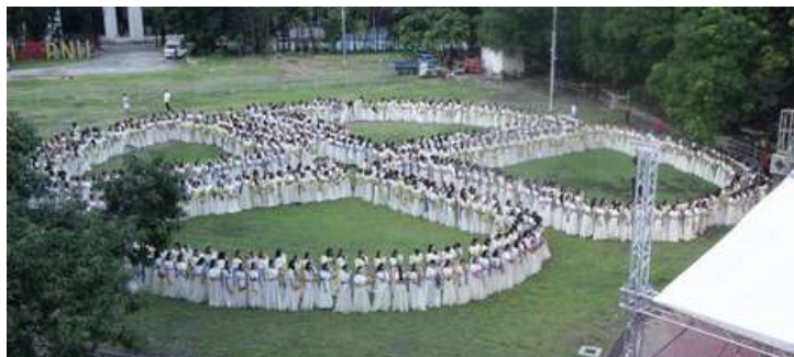
Bumuo ng imahe ng clover sa Grasslandia ang mga PNUans na nasa ikatlo at ika-apat na taon.