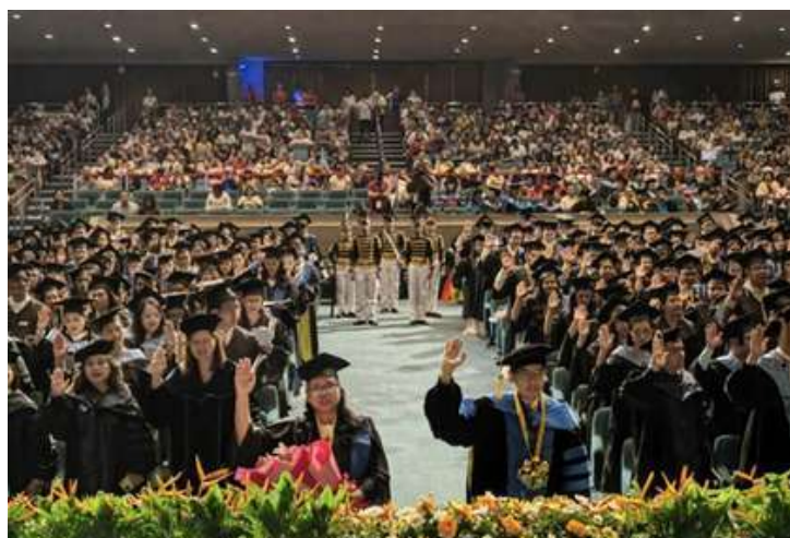
Graduates pledge to uphold PNU's core values of truth, excellence, and service.