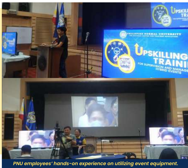
PNU employees' hands-on experience on utilizing event equipment.