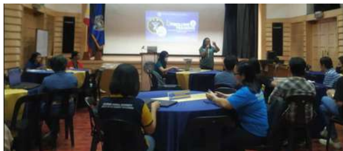
PNU employees prepare for the upskilling activity.