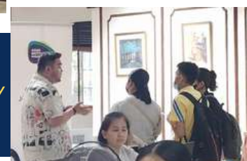
HR Representative from Asian Institute of Management (left) shared the career opportunities they offer to interested student-applicants (right).