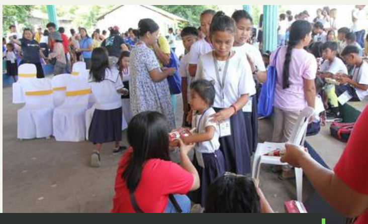
Feeding program to the students of Sta. Cruz Elementary School