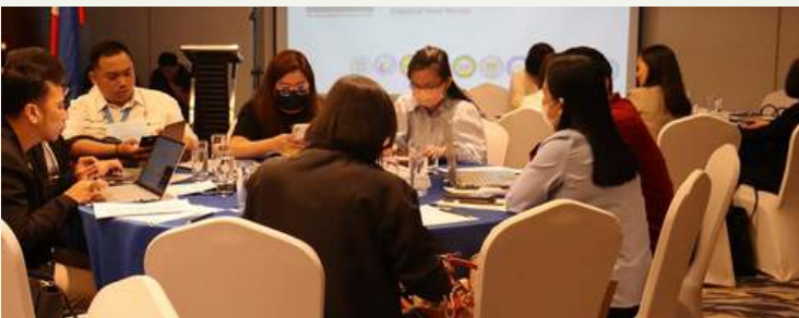
Participants from 3NS universities were composed of University Presidents, Vice Presidents for Academic Affairs, and Deans of the College of (Teacher) Education.

Hosted by the Philippine Normal University, the Network's Lead Convenor, the meeting furthered the partnership of the 10 universities as they came up with productive agreements on the specified set of agenda aimed at mitigating the current challenges surfaced by the pandemic. One of these items is the proposed 3NS engagement with the Second Congressional Commission on Education (EDCOM II) on the conduct of commissioned research projects to shed light on issues related to teacher/pre-service education and in-service training and development.