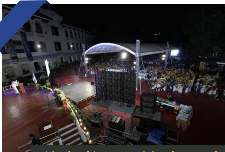
Celebration of the PNU Grand Alumni Homecoming

Prior to the program, PNU held a formal launching of the Alumni Park, a dedicated space on campus where alumni can gather and connect. Attendees took part in the unveiling of the alumni walk and "batch for a bench" initiatives. These projects allow the alumni to adopt tiles and benches in the park for a fee. In return, donors will have the opportunity to engrave their names or their batch's in the Alumni Park.