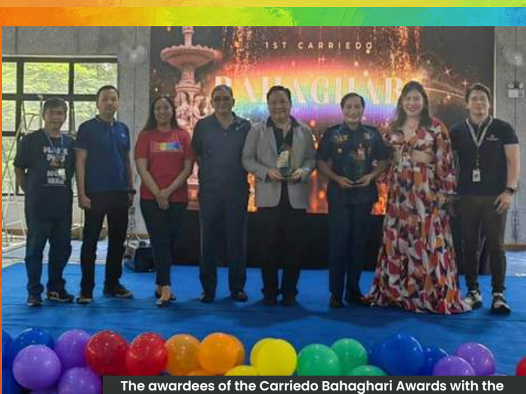
The awardees of the Carriedo Bahaghari Awards with the organizing committee of the event