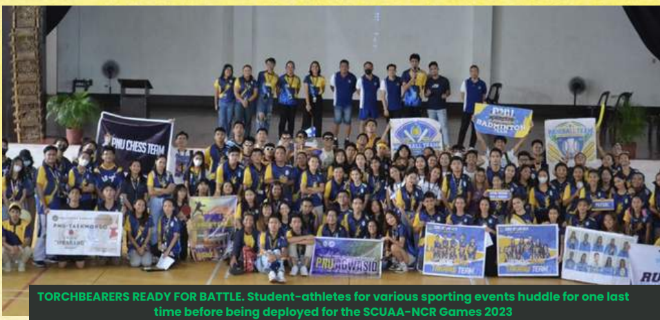
TORCHBEARERS READY FOR BATTLE. Student-athletes for various sporting events huddle for one last time before being deployed for the SCUAA-NCR Games 2023

After two years of hiatus due to the pandemic, the Philippine Normal University's herd of gallant student-athletes, collectively known as the Torchbearers, were once again ready to battle it out for athletic supremacy against the best in the region. They vied for the gold in the various competitions in the State Colleges and Universities Athletic Association-National Capital Region (SCUAA-NCR) 2023 on June 19 to 23, 2023.