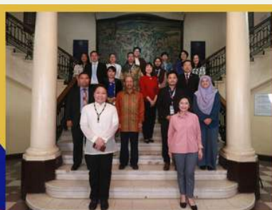
The delegates of the 15th Meeting of Presidents from various AsTEN member institutions

She also quoted Martin Luther King, Jr., who said, "Everybody can be great because anybody can serve. You only need a heart full of grace, a soul generated by love."