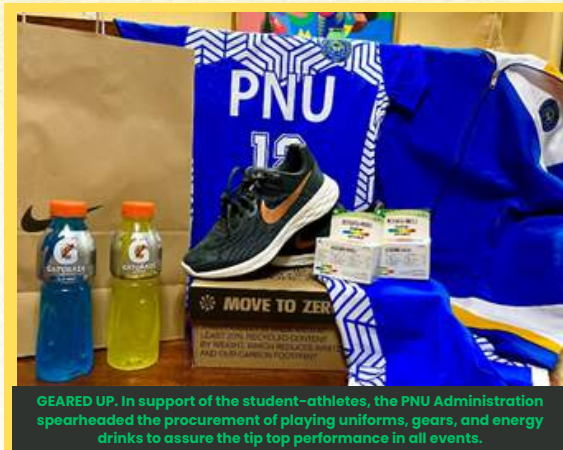
GEARED UP. In support of the student-athletes, the PNU Administration spearheaded the procurement of playing uniforms, gears, and energy drinks to assure the tip top performance in all events.