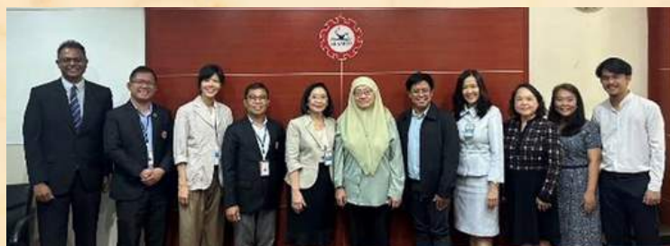
The AsTEN delegation and AsTEN Secretariat (PNU) with the key officials of Southeast Asia Ministers of Education Secretariat