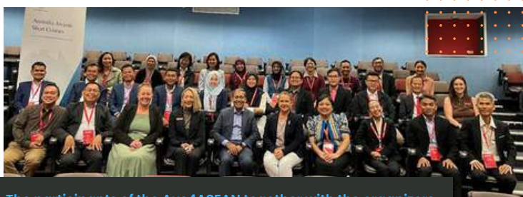
The participants of the Aus4ASEAN together with the organizers

The short course offered a comprehensive program that consisted of full-day lectures, workshops, and an exchange of expertise and best practices between Australia and the ASEAN countries, specifically forecasting the needed skills for future jobs as well as other economic labor trends in ASEAN.