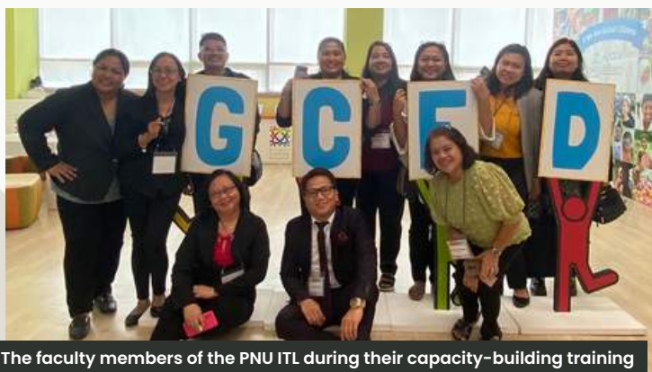
The faculty members of the PNU ITL during their capacity-building training