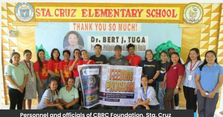
Personnel and officials of CBRC Foundation, Sta. Cruz Elementary School, and Philippine Normal University