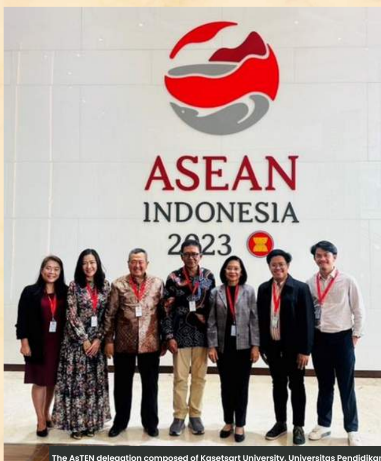
The AsTEN delegation composed of Kasetsart University, Universitas Pendidikan Indonesia, and Philippine Normal University (Permanent Secretariat)

As the permanent secretariat of the Association of Southeast Asian Teacher Education Network (AsTEN), the Philippine Normal University (PNU) joined the Kasetsart University and Universitas Pendidikan Indonesia in a separate meeting with the Association of Southeast Asian Nations (ASEAN) Secretariat and the Southeast Asian Ministers of Education Organization (SEAMEO) Secretariat on March 24, 2023 and March 27, 2023, respectively.