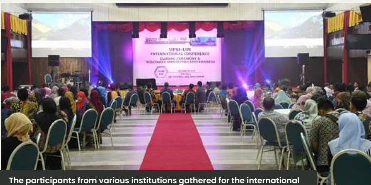
The participants from various institutions gathered for the international conference of UPSI-UPI.

Moreover, the members elected the new Executive Board of CAPEU. PNU was elected as Secretary. PNU has been serving as a member of the Board of Directors since 2015 and its acceptance of this new leadership role signifies its continuing commitment to the Consortium.