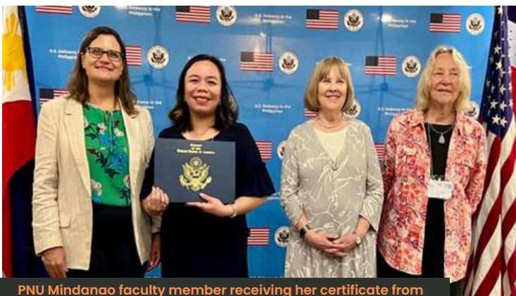
PNU Mindanao faculty member receiving her certificate from the organizers of the workshop

PNUM's participation in this intensive training and workshop is testament to the University's initiatives to assist and support English teachers, both in the basic and higher education levels, to improve their methods and skills in teaching the subject.