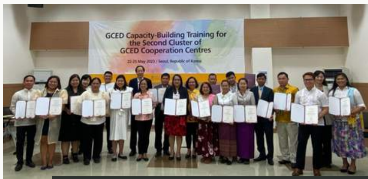
The faculty members of PNU ITL holding their certificate of completion with the organizers of GCED Capacity-Building Training

The Philippine Normal University sent 12 faculty members of the Institute of Teaching and Learning (ITL) to the Global Citizenship Education (GCED) Capacity-Building Training for the Second Cluster of GCED Cooperation Centres (GCC) at the Asia-Pacific Centre of Education for International Understanding (APCEIU), under the auspices of UNESCO, on May 22-25, 2023 in Seoul, Republic of Korea. The goal is to equip the participants with the knowledge and skills for integrating GCED in schools and teacher education institutions (TEI). The training was programmed to hold a variety of sessions, presentations, and visits to schools and universities, providing valuable insights and promoting collaboration among the participants.