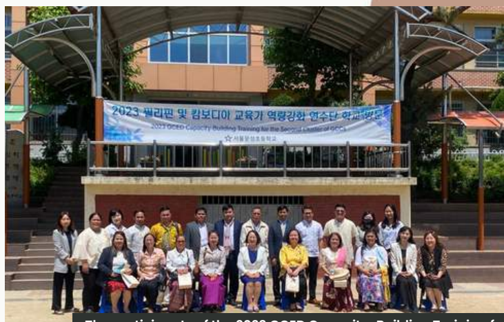
The participants of the 2023 GCED Capacity-Building Training for the Second Cluster of GCC's