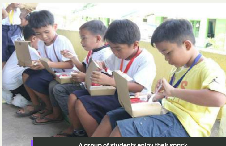
A group of students enjoy their snack.