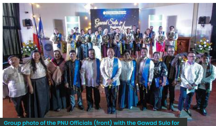
Group photo of the PNU Officials (front) with the Gawad Sulo for Eminent Alumni Awardees (back)

The Gawad Sulo for Eminent Alumni is held annually and managed by the Alumni Relations and Services Office (ARSO) and the Office of the Vice President for University Relations and Advancement (OVPUA).