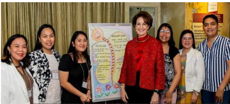
PNU Mindanao Faculty with the representative of the TESOL workshop