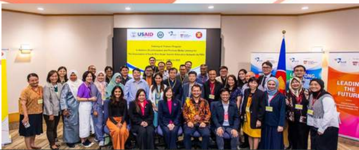
Participants of the ToT Program from ASEAN member institutions with the key officials from NIE Singapore, ASEAN, USAID, and US Embassy in Singapore