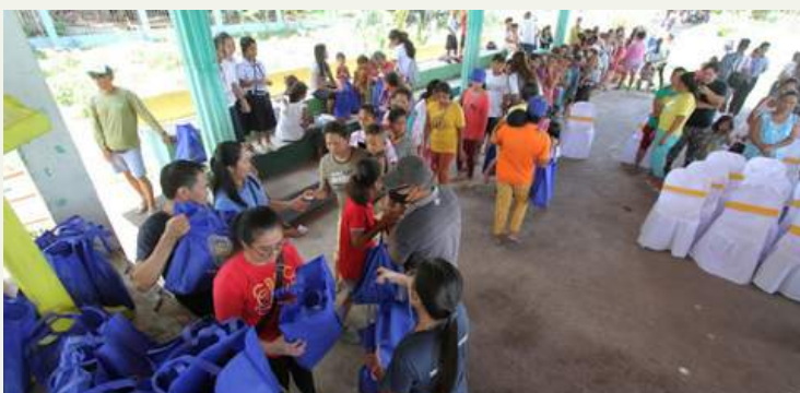
Distribution of food products to the community of Abelling