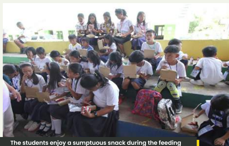
The students enjoy a sumptuous snack during the feeding program at Sta. Cruz Elementary School, Tarlac.