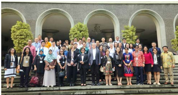
Participants and trainers of IDC SEA 2022/2023 at Universitas Gadjah Mada, Indonesia

The German Academic Exchange Service (Deutscher Akademischer Austauschdienst [DAAD]), German Rectors' Conference (Hochschulrektorenkonferenz [HRK]), Osnabrück University of Applied Sciences, and Centre for Higher Education (CHE) jointly organize the International Deans' Course in Southeast Asia, Africa and Latin America. This intensive training course for middle managers of higher education is part of the DIES Programme (Dialogue on Innovative Higher Education Strategies) coordinated by DAAD and HRK. The key objective of IDC Southeast Asia is to bring together a group of 30 newly elected deans, vice-deans and heads of departments from universities in the Southeast Asian region and to prepare them for the challenges of holding a dean's position in a changing higher education landscape. Issues such as strategic faculty management, financial management, quality assurance and leadership are key parts of this course. A soft skills training and exchange with German university leaders about higher education reforms are included as well.