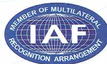
President - AJA Registrars Inc.

This certificate is issued in respect of the locations & scope of registration detailed in the Associated Registration Schedule. This certificate is the property of AJA Registrars Inc., 2nd Floor JD Tower Commerce Avenue, Madrigal Business Park, Ayala Alabang, Muntinlupa City 1770, Philippines and must be returned on request. A member of the AJA Group of Companies