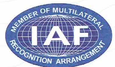
President - AJA Registrars Inc.

This schedule and the certificate it accompanies remain as a property of AJA Registrars Inc. and must not be altered or defaced in anyway. They must not be copied in whole or in part without the written permission of the President of AJA Registrars Inc. Deliberate misuse of the certificate or schedule will result in cancellation without notification.